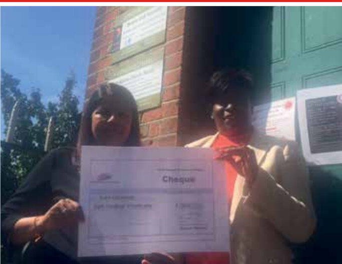
A huge thank you to Greater Heights for raising a wonderful £800 for us at their charitable ball in June.