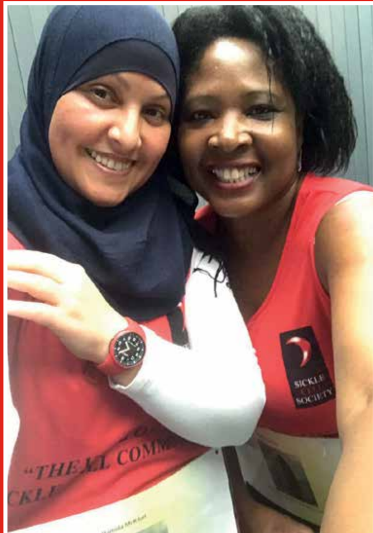
A huge thank you South Thames College for running up 40 floors to complete the Gherkin Challenge to promote awareness of sickle cell.