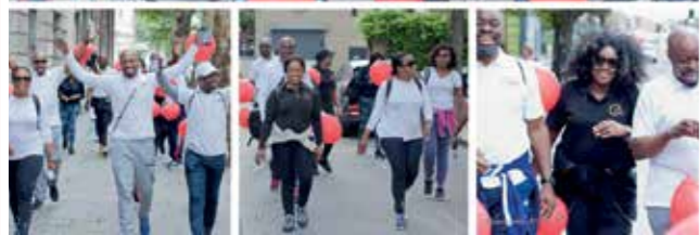
A massive thank you to the Vin Club for raising £8800 for us through their charity ball and walk