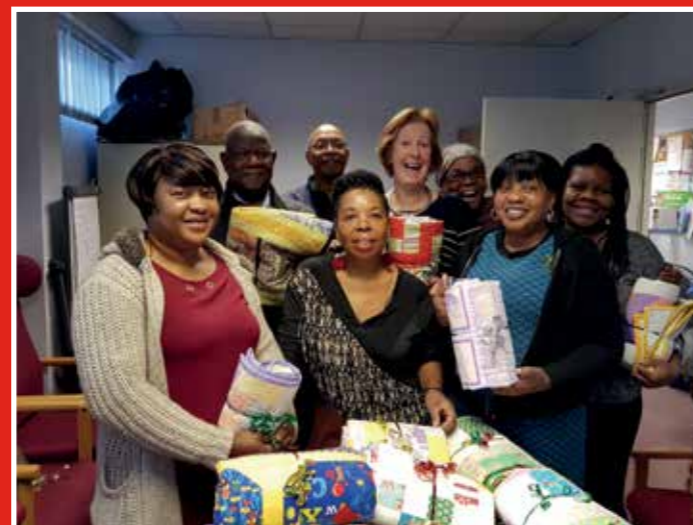
Members and trustees of Croydon Support Group show off some of the blankets