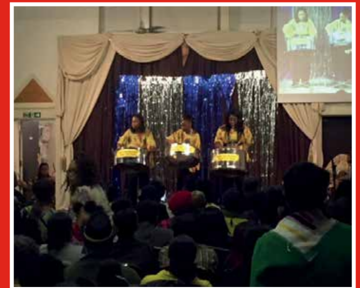
A big thank you to COGIC for donating money to support us at their Black History Month celebration