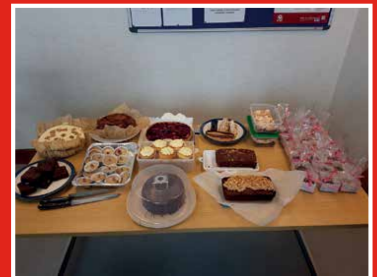
A big thank you to the National Bank of Kuwait for raising £215 for us through their delicious food.