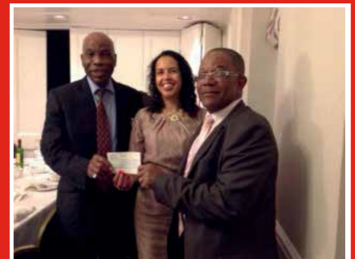
A big thank you to the Catenian Brothers of Hastings 66 Circle, Sussex Province for donating £750.